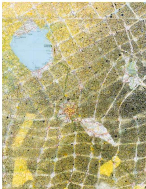
#SBACMI20240301, gouache on waxed maps, 200 x 154 cm, 2024 - detail

Sophie Bouvier Ausländer has held numerous solo and group shows in Switzerland, France and the UK. Her works entered important institutional collections such as the Musée d'Art de Pully and the Musée des Beaux-Arts du Locle. The artist has recently received the prestigious Grand Prix awarded by the Fondation Vaudoise pour la Culture.